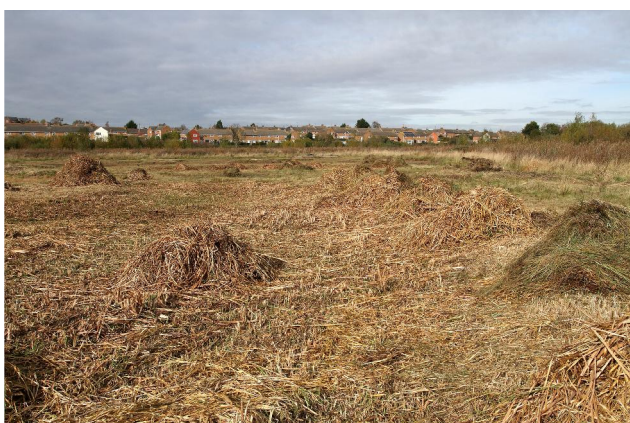
The cleared scrape, 30 Oct.

Once the scrape work is complete we move onto clearing reeds which should start in the next couple of weeks.