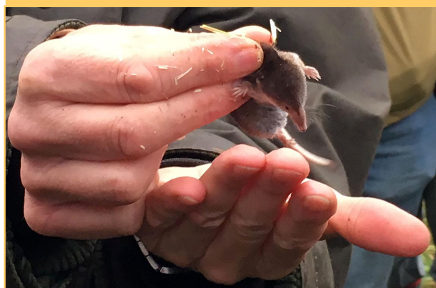
Inspecting a Pygmy Shrew, a new species for Avon Meadows (see Events section below).

the right hand (river) side in the longer grass. They do not cause a problem unless you walk over that area.