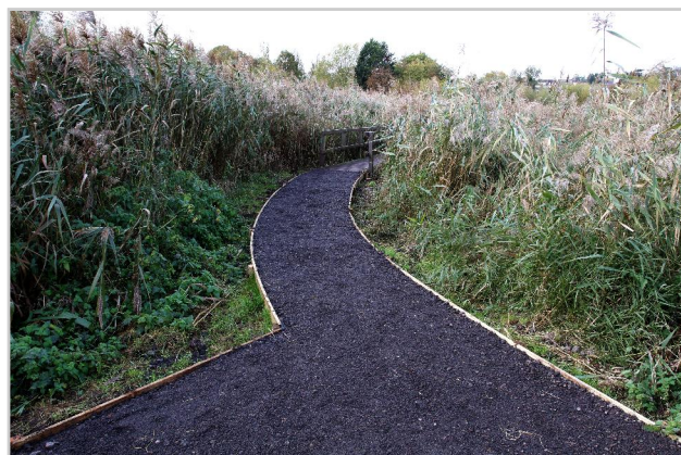
Improvement to the path off the boardwalk completed by volunteers.

the right hand (river) side in the longer grass. They do not cause a problem unless you walk over that area.