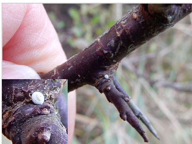
The egg of the Brown Hairstreak butterfly. As you can see you need sharp eyes to spot them, they are about 0.75mm in diameter.

While looking for Brown Hairstreak eggs we came across an egg of the Blue-bordered Carpet moth, another new record!