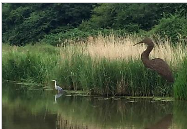
We only count one of these herons!

The Bird Group's average morning count so far in 2017 on our Thursday morning bird count remains at 44 species. There have been 31 bird counts in 2017 and we have logged 12,000 birds.