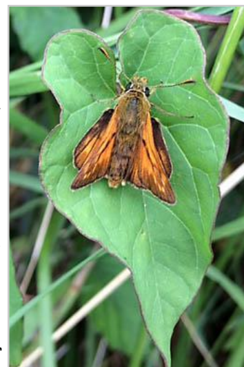
Large Skipper

This seems to be a much better year for butterflies and although the species count remains the same the average number of butterflies is 69% up on last year. This data comes from weekly transects by Kirstie Chippendale. There are only 59 species of butterfly that occur regularly in the UK and many of these are only found in particular habitats so the scope for finding new species on our site is strictly limited.