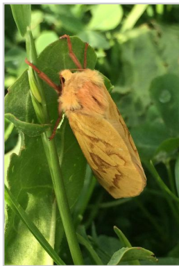
Ghost Moth (female)

The Moth Group has had 4 moth recording nights so far this year which has produced 123 species, of which 18 are new to Avon Meadows. The count of 123 is the same as that for the whole of 2016 and then we had only 9 new species in the whole year so 2017 has the makings of a good year. Of the new species 12 were micro-moths and the other 6 were macro-moths, namely, Peach Blossom, Little Emerald, Treble Brown Spot, Scarce Footman, Triple-spotted Clay and The Clay,