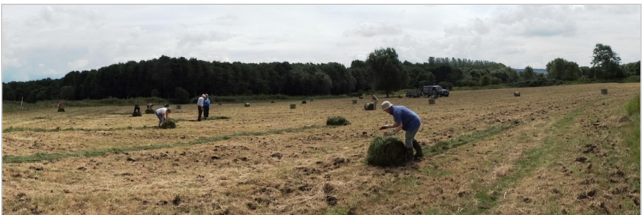
Rolling out the bales of green hay in Middle Meadow

Synopsis of a report by Ken Pomfret. See the website for a full report [ http://www.avonmeadows.org.uk/ click bottom tab (Documents & Learning Resources) then select Green Hay strewing report July 2017. ]