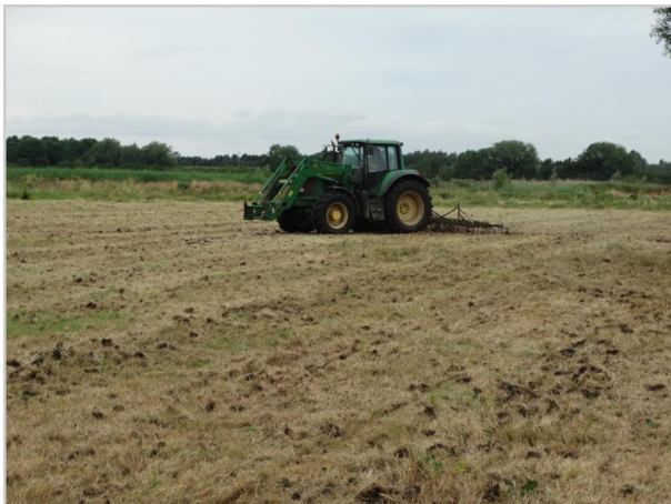
Scarifying Middle Meadow