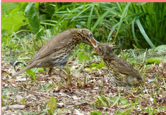
A Song Thrush feeding its chick on Bioblitz Day.