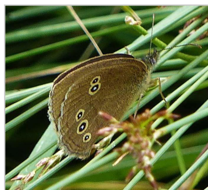
Ringlet butterfly.

Total species count on Bioblitz day was 357 of which 27 were new to Avon