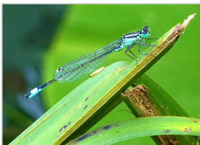
Azure Damselfly

We maintain lists of all species recorded from Avon Meadows which are available to members.