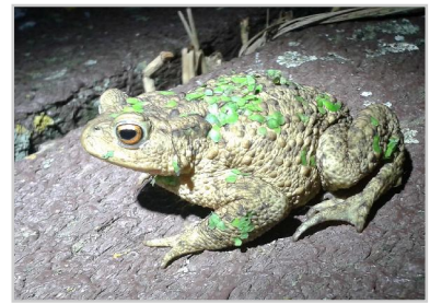
A Common Toad caught on camera on a moth night covered in duck weed.

Unlike many of the species we survey plants do not move about. However this can make seeking them out quite challenging. We are slowly finding more species.