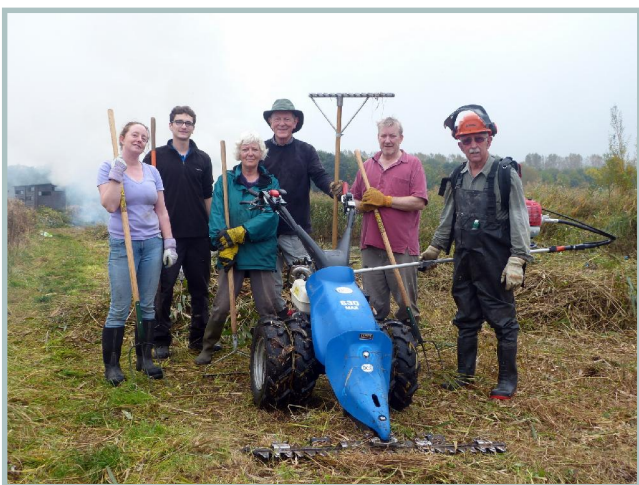
A work party ready for action!

Botanical Surveys: We have a number of surveys coming up, can you help—get in touch with Liz if you can.