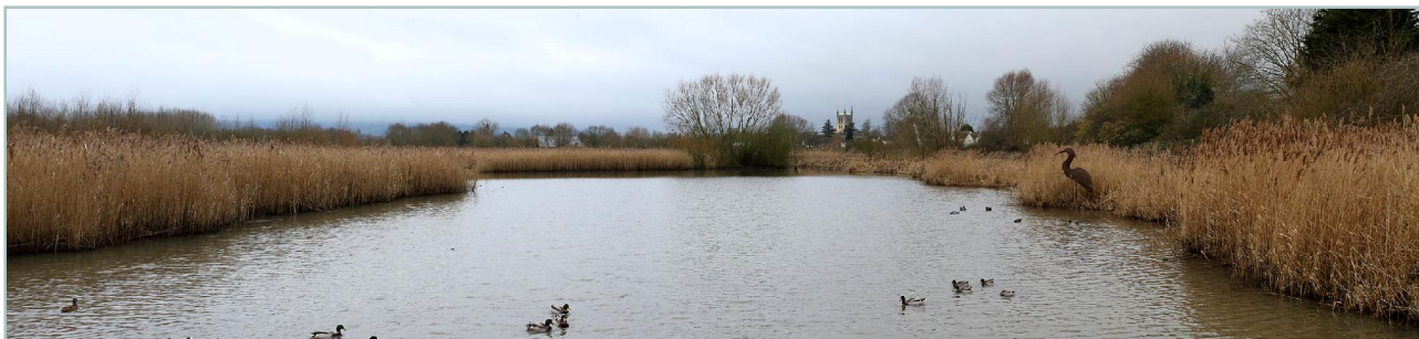
A dull January morning but note that the willow heron has returned!