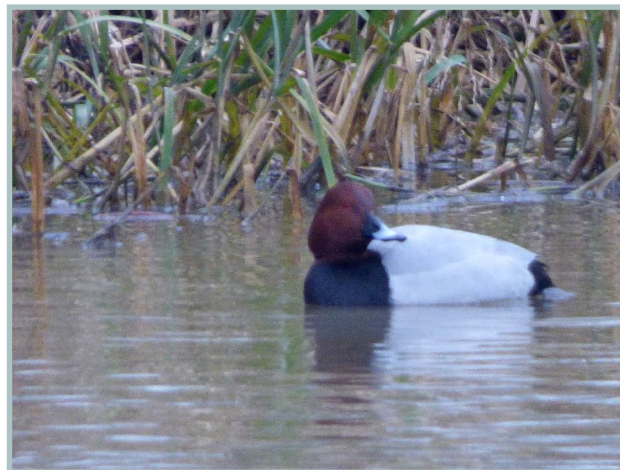
A Common Pochard photographed on the river beside the Wetland on 19 Jan 17. This is the 120th species recorded to date. It is one of the diving ducks (Mallards are dabbling ducks) which like deeper water than is usual on the Wetland.

We have got off to an excellent start this year with 4 surveys under our belts already producing 57 species and the most recent weekly count of 48 species was our best-ever January count. To top it off we had a new species too, the Common Pochard!