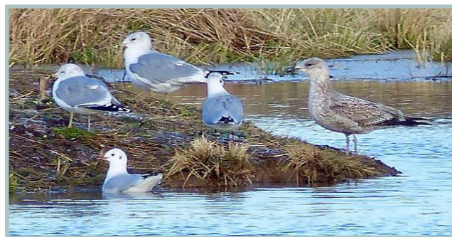
An interesting photograph showing 3 species of gull on the scrape. Top left are Common Gulls (Not common with us! Note white tips to black wing feathers), in front in the water is a Black-headed Gull (black dot behind the eye) and the brown gull on the right is a first winter Herring Gull. Herring Gulls take 4 years to get their full adult plumage.

Little Grebes have been seen on the main pool recently; they last bred on the Wetland in 2013.