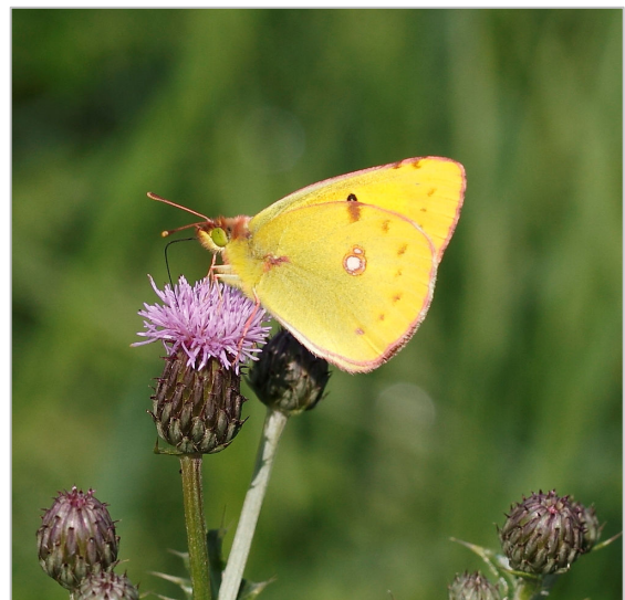
Fig. 5 Clouded Yellow butterfly photographed on 17 Sep 15.

The end of the butterfly monitoring season arrived with overall butterfly numbers down by 24% on last year presumably due to cool, wet weather occurring at the wrong time. However this was offset by our first record for Clouded Yellow on 7 Sep followed by several more 10 days later. These records kept our total species count up to a respectable 20 species recorded throughout the summer. A Painted Lady was recorded on 27 October, a new (very) late record for us (Sarah's photograph is on her blog, Coot's Eye View).