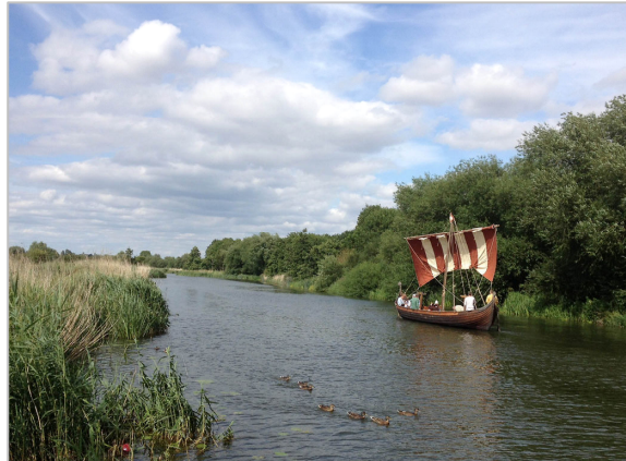
Fig. 3 The ducks do not seem to mind the ferocious Vikings! (L Etheridge)

The living history exhibition of Viking and Saxon life proved very popular, with members of the public able to try on chain mail suits, helmets and heft swords, as well as seeing how leather, horn and wood were worked to create buttons, belts and jewellery items.