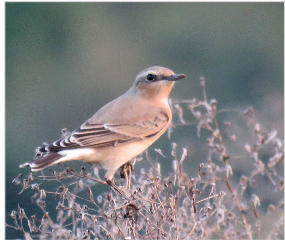
Fig. 4 A young female Northern Wheatear photographed on the Wetland on 26 Oct 15.

The last Swifts were seen on 5 Aug but Meadow Pipits arrived on 12 Sep along with Common Snipe a few days later, although these first snipe have moved on. It is pleasing to report that both a Water Rail and a Common Stonechat have returned, hopefully for the whole winter. A Green Sandpiper was heard arriving on the main pool after dark on a moth night on 7 Aug. A Little Egret flew over the main pool on 17 Sep. At least 3 Cetti's Warblers are singing now. A Common Greenshank stayed for about 24 hours on 19 Sep around the new scrape. Bullfinches are not common on the Wetland but several were recorded eating berries during September. Common Teal returned to the main pool on 17 Sep. Single Willow Warblers were recorded on passage in Sep, a Red Kite flew over on 13 Oct and a Barn Owl was flushed from one of our large nest boxes on the same day. Amazingly our second Northern Wheatear was seen and photographed on 26 October!