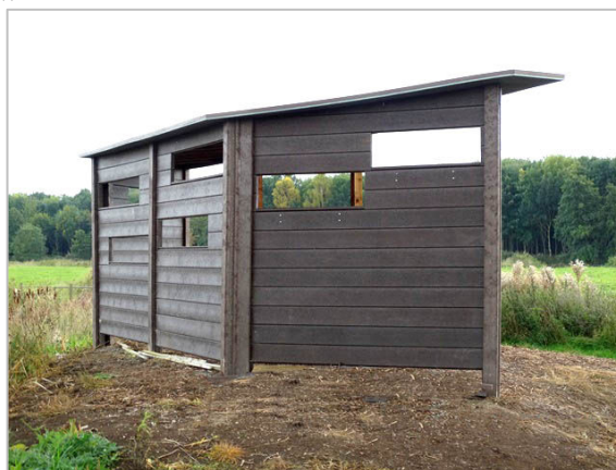
Fig. 2 The new bird screen is complete except for its 'living roof'.

Bird screen is now structurally complete. It was designed and erected by the Friends of Avon Meadows but the materials were bought thanks to a Wychavon Community Grant and we are very grateful to Wychavon for this grant.