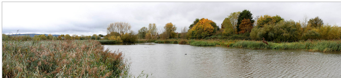
Fig. 1 Taken on a dull, windy day at the end of October. Although the surface of the water is smooth it is quite shallow as we await winter rain to raise the level.