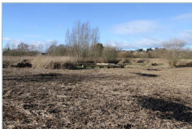
Area E in the process of being cleared. The new dipping platform can be seen in the background.

Each autumn as the 5-year reed cutting cycle comes round two areas of reedbed are cut. Here we can control water levels which are kept low until around the end of February.