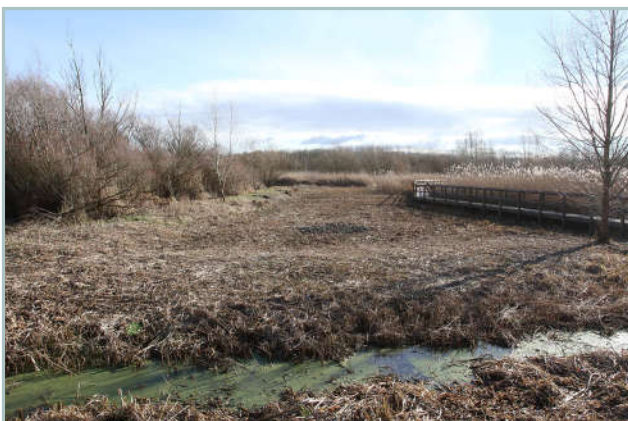
Area G, last cut 5-years' ago.

Regular visitors to Avon Meadows will have noticed that while the cut areas look bare today, in 12 months' time you not be able to tell what was cut the previous winter! The reason for cutting is to keep the reed beds in good condition and to stop dead reeds from building up and creating dry areas simply by raising the ground level.