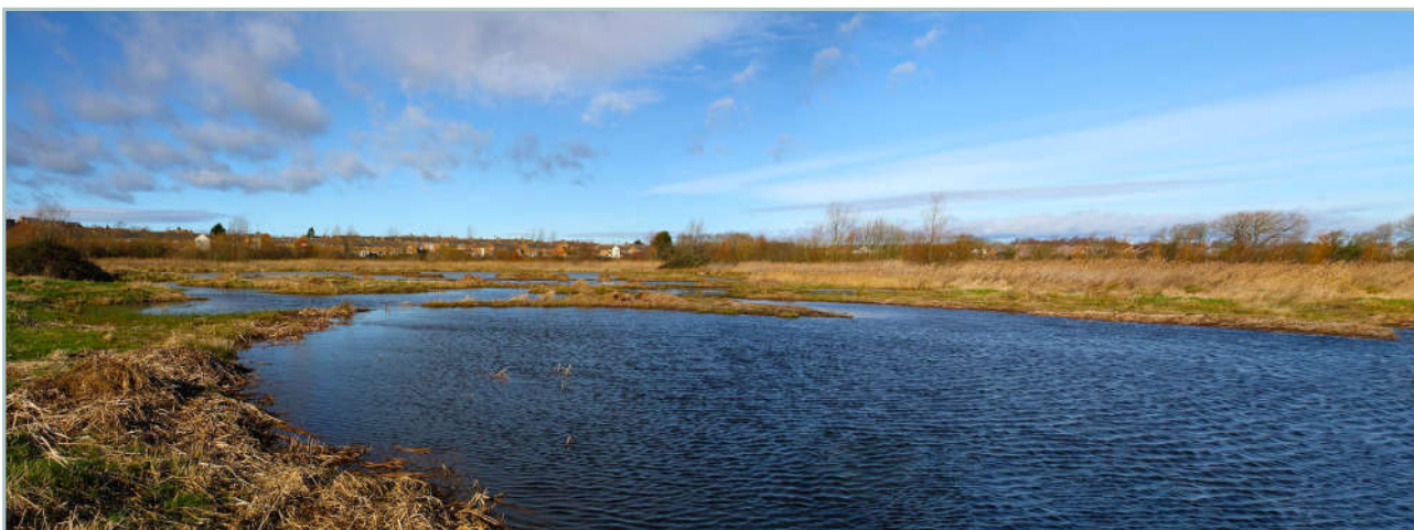
The scrape cleared by volunteers and now nicely filled with water.