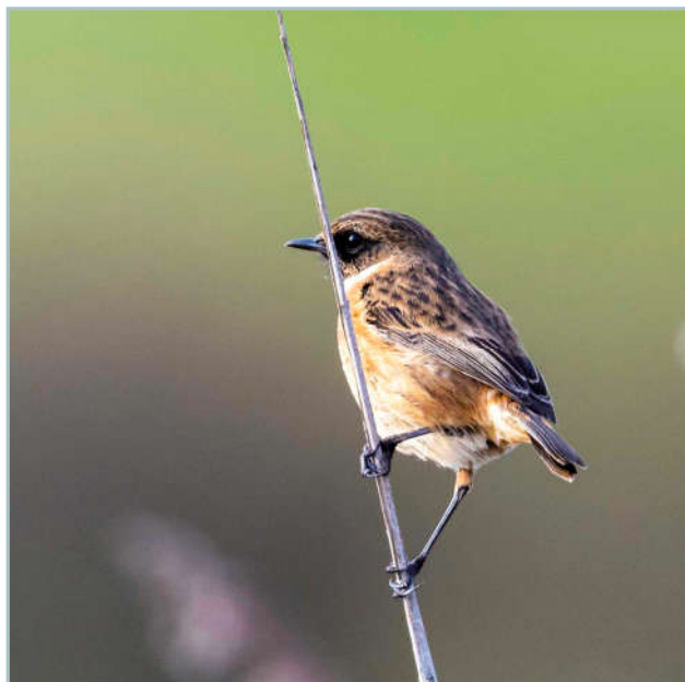
A nice female Stonechat, a familiar sight in the South Meadow this winter.