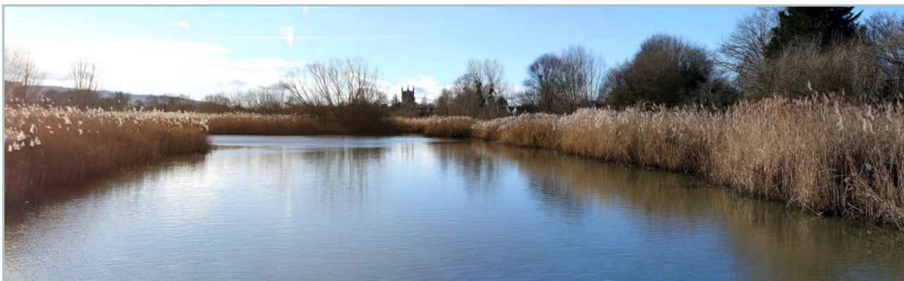
Taken on 1 Feb 2022 on a day that seemed to be like spring. However we have to get through February and March before we can hold those thoughts!