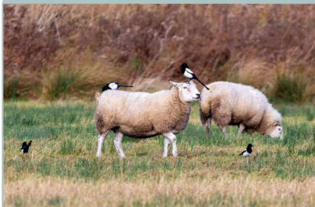
The Magpies liked to be around the sheep and the sheep did not seem to mind. There was a 'mischief' of 18 Magpies present at the time this photograph was taken.