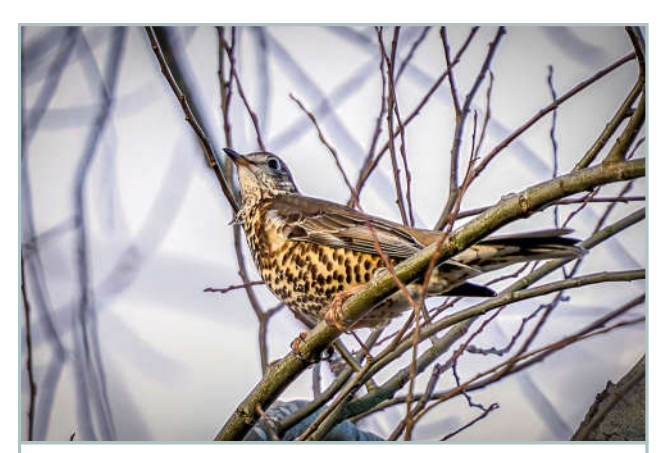
A nice shot of a Mistle Thrush, taken on Thursday 28 Jan 21, which can be an elusive bird on Avon Meadows. The spots on its breast are much rounder than those on the rather similar Song Thrush.

If you currently pay by Standing Order and would like to make a one-off Life Membership payment, <u>don't forget to</u> <u>cancel your Standing Order when you have done so</u>!