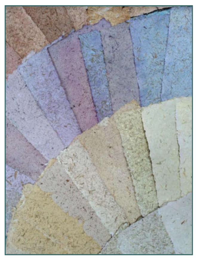
Dyed papers made from reeds and silver birch. collected on Avon Meadows.