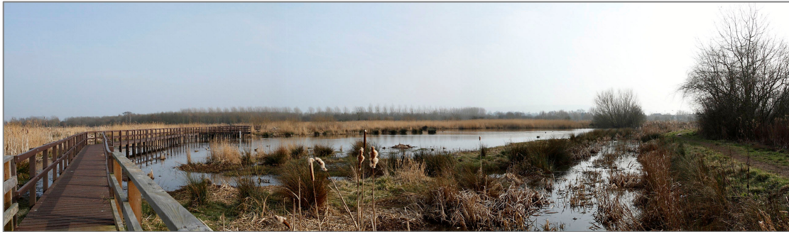
Fig. 1 The Wetland on 2 Mar 2012 with the water level 380mm below that of the same time last year and showing an area of reeds cleared by students from Pershore College.