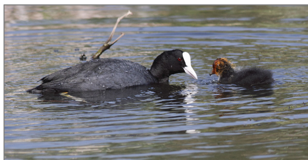
Fig 3. One of our first Coot chicks.

On 3 April Sand Martins, House Martins and Barn Swallows were recorded passing through going north. Early April also saw our first chicks; Mallard were first closely followed by Coot. Now there are at least 2 Coot broods that have hatched and one brood of Moorhen. The first Sedge Warbler of the year was recorded chattering from the reeds on 5 April.