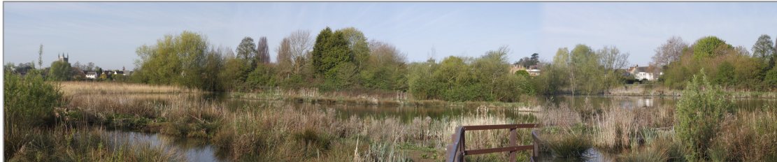
Fig 1. Early April with trees coming into leaf. Note with willow growth in the left and right foreground (R D E Stott)