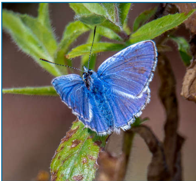
A nice photograph of a Common Blue taken beside the main path.

The butterfly year was about average with most counts falling in the middle of the range. There was a new late record of a Comma for Avon Meadows on 17 October. The whole summer was notable for the number of Painted Ladies around, a migrant from North Africa. There were also good numbers of Marbled Whites in mid-summer.