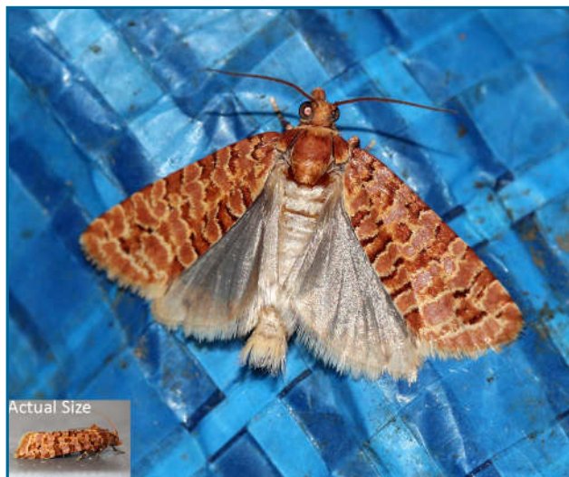
Not all micro moths are dull! This was new for Avon Meadows when it was trapped on 5 July it is called Lozotaeniodes formosanus .

At present we have recorded 385 moths on Avon Meadows. This year we added 10 species to the total over 7 collection sessions. Three of these were tiny micro moths which only have scientific names. The new macro moths were White-spotted Pug, Black Arches, Pale-shouldered Brocade and of course Dotted Fan-foot.