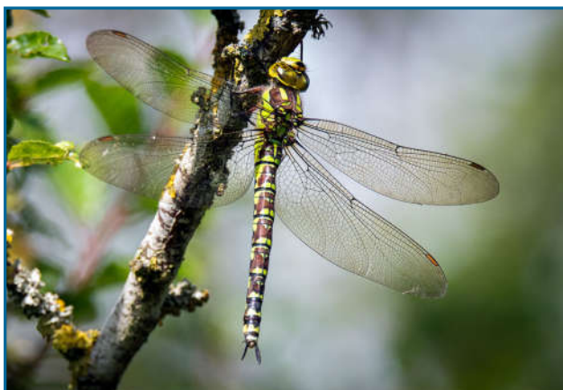
This Southern Hawker alighted near us during a Thursday bird count in August.

Early promise was fulfilled and this proved to be a good year for dragonflies, 2019 producing the highest maximum daily count recorded so far.