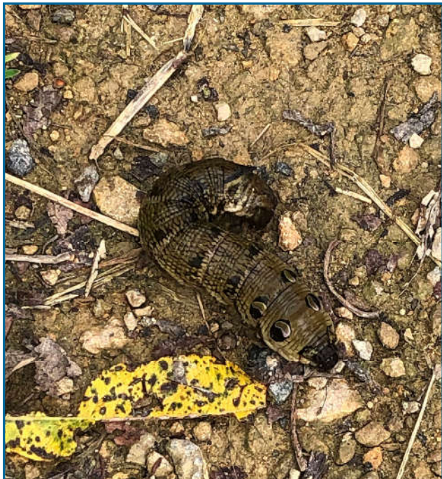
An Elephant Hawk Moth caterpillar. Its extra 'eyes' are there to confuse predators. This is a common species in the trap in mid-summer but caterpillars are less often found. The caterpillar lives on Great Willowherb of which there is a profusion around the main pool.

Unlike butterflies and dragonflies, which each have less than 100 species resident in the UK, for moths it is about 2500! So it is much easier to find new ones for Avon Meadows. Most people associate moths with night time but this year we found 3 new species for Avon Meadows in daytime. A Mother Shipton and a Scarlet Tiger were both found in the