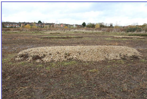
One of the 4 scrape islands the volunteers covered with stones during the winter stones to encourage wading birds.

With the spring arrivals 92 bird species have been seen so far this year.