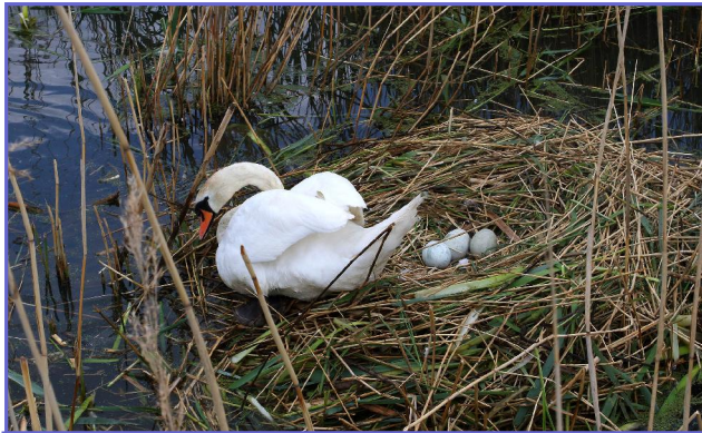
STOP PRESS! 'Our' Mute Swans have chosen a nest site beside the boardwalk. Let us hope that everything goes well for them.