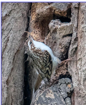
Treecreeper with nest material.

Although not a new bird, the nest site of a Treecreeper has been found on Avon Meadows for the first time. Previously they have only been seen a few times each year.