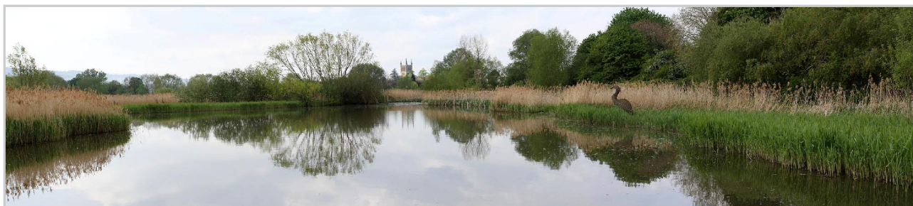
Taken on 30 April as spring arrives in full force. The reeds on the left were cleared to expose the willow heron and the reed growth has taken place over the last four weeks.