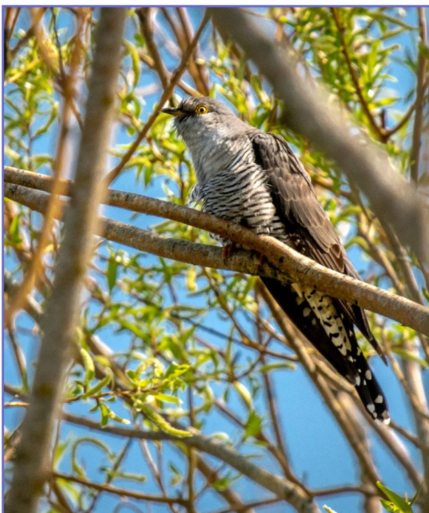
Avon Meadows' first Common Cuckoo for 2019.

As was mentioned in the last Newsletter, 4 of the scrape islands have been covered with stones. The idea is to tempt Little Ringed Plovers to breed here. Normally they lay their eggs directly among stones on a beach and rely on camouflage and parental attention to keep them safe. No beaches here but we are providing the next best thing. We were delighted to see a pair of Little Ringed Plovers arrive on 24 April. Now it is up to them!