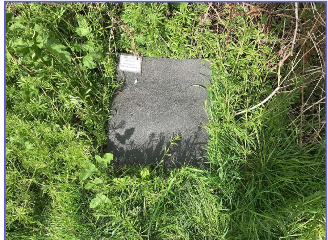
One of our Slow Worm mats.

Some of our enthusiastic volunteers have started a Slow Worm monitoring scheme. To achieve this 44 mats, similar to that in the photograph below, have been set out around Avon Meadows. These will be inspected carefully by trained people so that we can estimate how many Slow Worms there are and where they like to go. Please resist the temptation to disturb any of these mats.