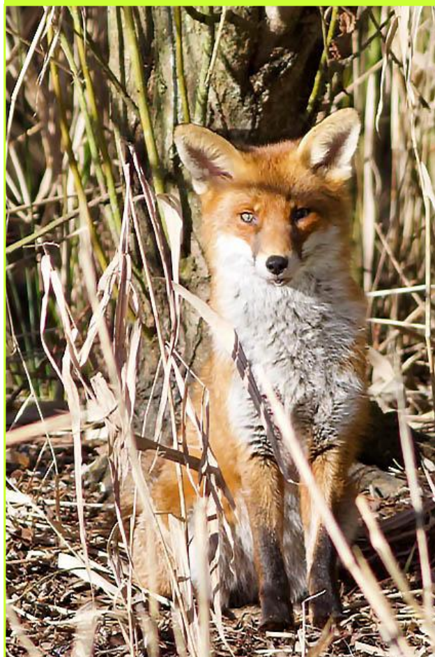
A nice photograph of a Fox enjoying the late winter sun on Avon Meadows.