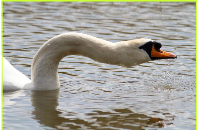
An interesting photograph of one of our Mute Swans having a drink taken by one of our younger members.