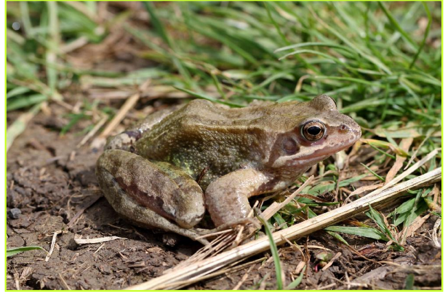
A Common Frog enjoying the spring sun on 1 May.

A report on 30 April of both a Whinchat and Northern Wheatear on the scrape which are both new species for this year. Clearly the Whinchat is a bird of regular habits as one was seen on 30 April 2016! These are migratory birds and usually only stay for less than one day.