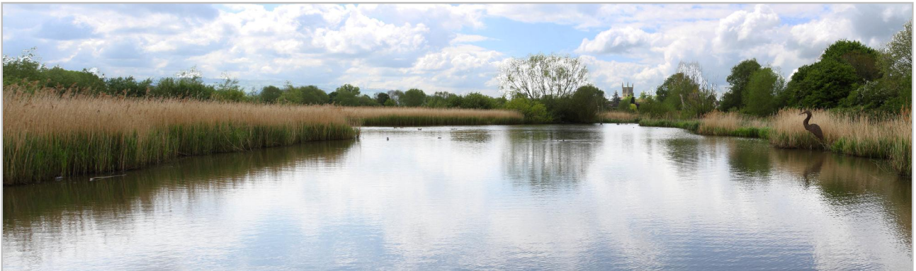
Sunshine between the showers with the Cuckoo calling in the background