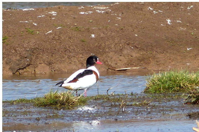
Common Shelduck on the scrape on 16 March 2016.

On 21th a Lesser Whitethroat was heard calling (another new early record—20 days earlier).