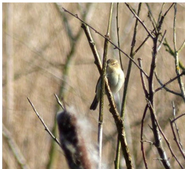
Cetti's Warblers are really difficult to see let alone photograph! They do show more often in early spring.

So far 86 species have been recorded on the Wetlands in 2016.