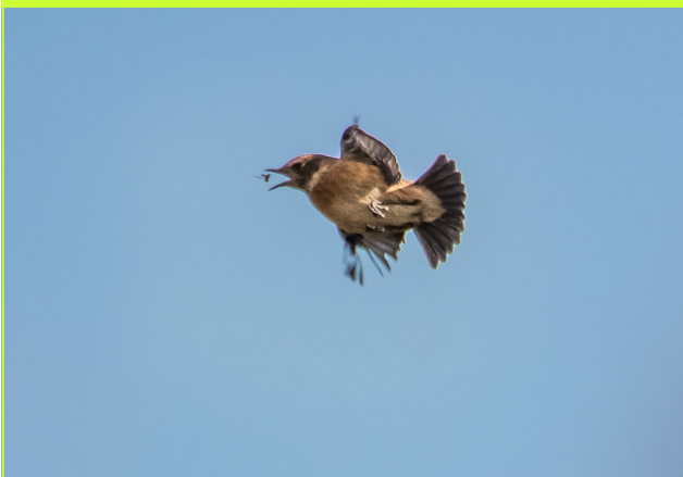
One of our Common Stonechats taking a snack!