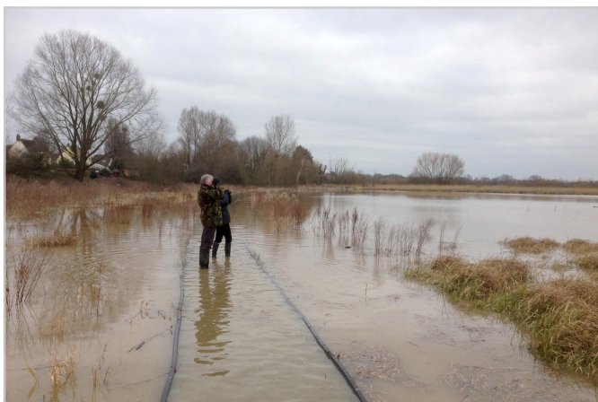
Dedicated survey work in rising flood water on 10 March!

By the end of March our Cetti's Warblers were displaying (see photo) with birds calling from 3 territories as the summer birds began to arrive. A Yellow Wagtail passed through on 23 Apr (last seen in 2014). This is a good spring for Willow Warblers which have been recorded throughout April. Yellow Wagtail was seen passing through on 23 Apr (last seen in 2014).