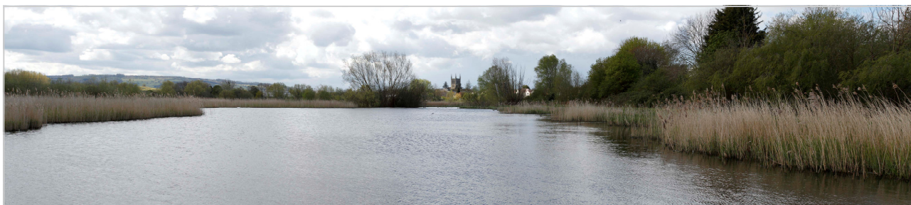
Taken on a cool April morning, spring is arriving in spite of the cool breeze.