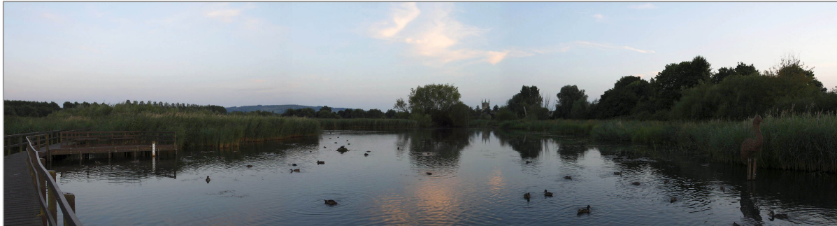
Fig. 1 Just before lighting the moth trap on Friday 25th July. Moulting Mallards seeking safety on the pool. (R D E Stott)