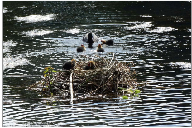
Fig. 3 The Coot chicks soon after hatching. (K Pomfret)

So far this year butterfly counts are generally up on 2013 although the significance of this so far only means that many species started flying earlier this year due to the warm weather.