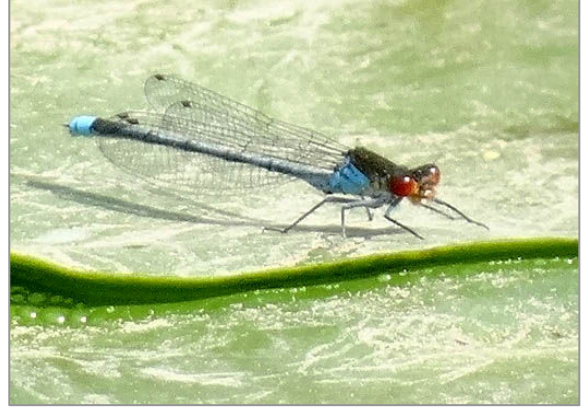
Fig. 6 A Red-eyed Damselfly resting on one of its favourite places, a lily pad. (P Jenkins)

If anyone is interested in either learning more about any of the above activities or simply having more information just let us know and it can be arranged. Similarly if any of you have a photograph of a creature you would like to know more about please eMail it in.