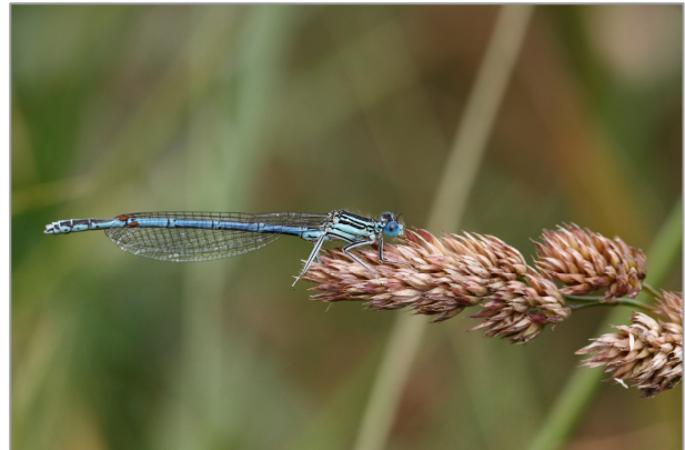
Fig. 7 A very cooperative White-legged Damselfly which allowed us to get close up!