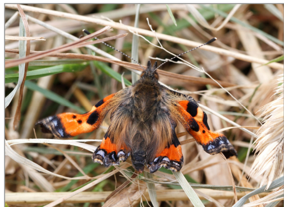
Fig. 5 A chance sighting of a recently emerged Small Tortoiseshell still pumping fluid into its wings. (R D E Stott)