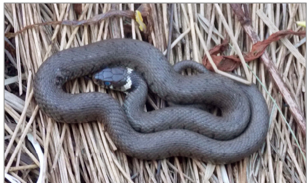
Fig. 4 We have a good population of Grass Snakes on the Wetland, this is a nice photograph of one waking up.