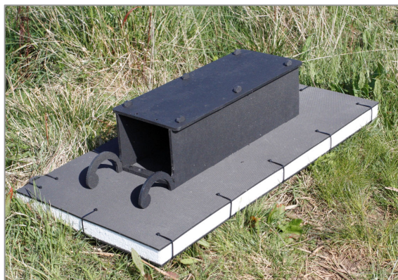
Fig. 5 Mink raft waiting to be positioned on the water. R D E Stott

We put out 2 mink rafts during April with the purpose of detecting the presence of mink. They take the form of a floating platform with a tunnel on top in which soft clay is left. Mink are very inquisitive and will surely investigate this structure in due course leaving their tell-tale footprints behind in the clay. It is quite likely that other semi-aquatic mammals will check the rafts out too, it will be interesting to see what we get.