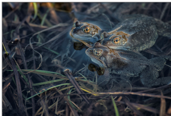
Fig. 4 Common Frogs bred in huge numbers this spring. F Swart

The mild winter has allowed Common Frogs and Common Toads to lay eggs in profusion which are now tadpoles. There are also large numbers of Water Snails present.