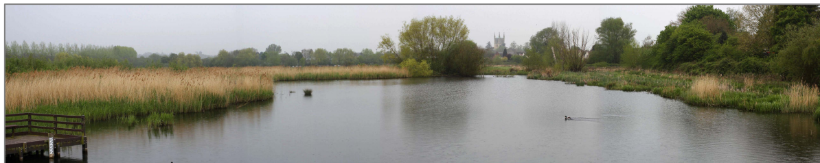
Fig. 1 April showers passing through on 25th. R D E Stott