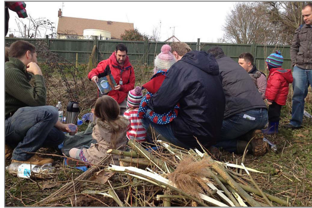
Fig. 2 Story time with the Bug Club. L Etheridge

Lots of families enjoy Avon Meadows. It's easy to get to and you can see wildlife up close. Earlier this year we ran a Bug Club for dads with children under 5, with a walk around the meadows to look at the birds, then we built a bug hotel and had hot chocolate and a story about The Very Hungry Caterpillar, of course!