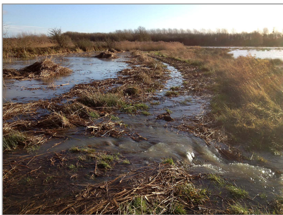
Fig. 6 Floodwater overflowing the south bund in Jan 2014.

The tilting weir was lowered on 27 Oct to reduce the water level of about 16.0m to allow access for reed cutting. It was raised again on Boxing Day so that we can collect water for the drier times of year. Recent floods have raised the level to excess and the level over the Wetland has been as high as 16.5m.