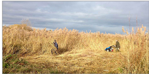
Fig. 2 Reed cutting in progress. The reeds grow to over 9 feet tall so serious machinery is necessary! (L Etheridge)

Reed cutting is a very necessary exercise in order to pull out dead reed material from previous years to maintain the quality of the reed bed as a good habitat for wildlife.