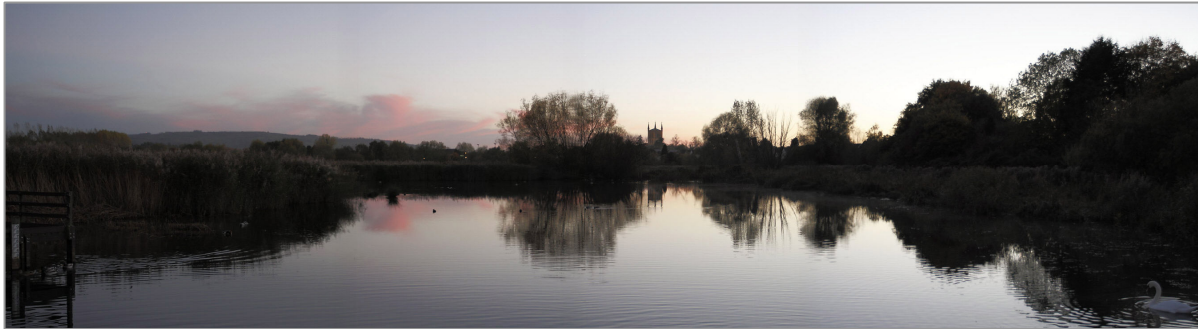
Fig. 1 Sunset on a calm November evening.