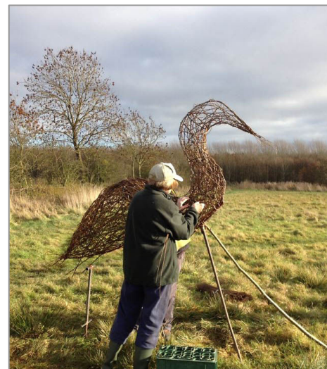
Fig. 3 Our Willow Heron under construction (L Etheridge)

Just before Christmas, a number of you turned up to help weave a large willow heron. It was a beautiful day, one of those crisp, sunny December days that reminds you winter isn't all about rain and wind. This elegant sculpture has had a weatherproof coating and sturdy legs attached and we're now waiting for water levels to drop so it can take its place on the edge of the main pool.