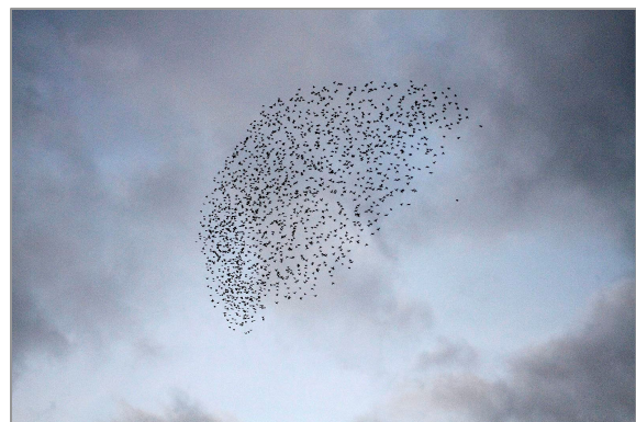
Fig. 5 Starlings over the reed beds taken at 16h53 on 1 Dec.

Many of you will have noticed the clouds (murmurations) of Common Starlings over the reed beds at dusk. This is a habit of Starlings outside the breeding season and thousands of birds roost in reed beds each night. The flock slowly grows as small groups join it and the whole swoops over the reedbed for up to 20 mins before dropping rapidly down into the reeds themselves. On the Wetland we have seen counts as high as 4,000 birds. This winter the WWT Gwen Finch Reserve has held 10 times that number so there is room for us to expand.