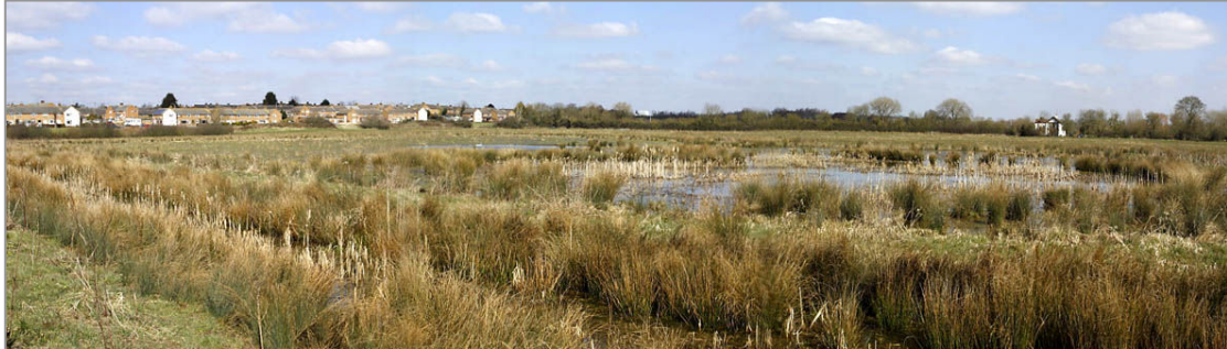
Fig. 3 The area to be developed into a scrape for water birds. Small islands will be created to provide safe refuges for the birds. (R D E Stott)

A provisional design has been created for the re-profiling of a new scrape for wading birds. It is planned that this will be in the boggy area just to the north of the main pool. Discussions have taken place with Worcestershire Wildlife Trust on its design and the Environment Agency, which controls all works within the river flood plain, has offered no objection. We are actively seeking planning permission and funding.