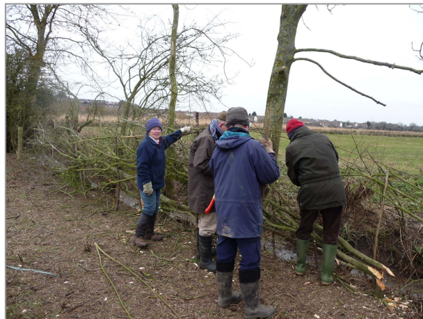
Fig. 4 The hedge-laying course in action. (V Wood)

We are fortunate to have received a grant to purchase some equipment for recording wildlife on the Wetland. This includes a bat detector, a camera for macro photography, a camera trap, pond dipping equipment and two moth traps. This equipment is for use on Wetland projects and particularly in conjunction with our HFL project.