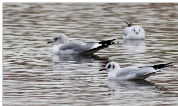
Fig. 5 An adult Common Gull in winter plumage (left) photographed on the main pool together with two Black-headed Gulls.

70 on 21 Feb. This used to be a common sight in Worcestershire but changes in farming practice has reduced their numbers. Another winter visitor to the UK is the Brambling and a single male bird was seen in January near the gardens of the houses on Cherry Orchard.