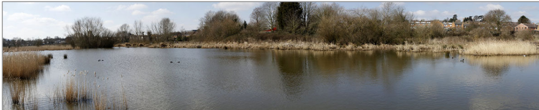
Fig. 1 Dry, cold winds have been a feature of recent weeks making the reeds and other plants at the water's edge look very dry. Taken on 6 Apr 13. ( R D E Stott )