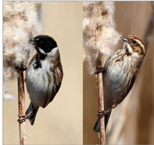
Fig. 6 Reed Buntings, male (left) and female (right) taken feeding on bullrush seeds from the boardwalk in April.

Early February saw a pair of Gadwall on the main pool and a Common Kingfisher has been paying much attention to the pools during the whole period. Common Gulls are not common on the Wetland but one or two have appeared occasionally throughout the winter. You can see from Fig.5 the Common Gull is a little larger than the Black-headed Gulls and in flight have distinctive black tipped wings with the very ends of the wing white. The first Chiffchaff of the year appeared on Valentine's Day. A Water Rail and Lesser Redpoll were recorded on 7