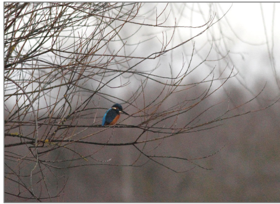
Fig. 2 A Common Kingfisher taken on 23 Dec 12 during the floods looking for fish in shallow water over the main path. (R D E Stott)

In winter sightings mainly concern birds as flowers and insects are dormant during these months. Birds have thrown up some surprises with 3 new species for the Wetland since the last Newsletter. A Yellow-legged Gull was seen standing on the ice on the main pool on 6 Dec. Rob Prudden reported 9 Bohemian Waxwings flying over on 17 Dec. Waxwings are known as an "irruption" species meaning that in some years large numbers invade the British Isles from Europe and this is one such year. Sadly not many have invaded Worcestershire and Rob's is the only record for the Wetland to date. A Lesser Redpoll was recorded with Goldfinches near the main gate on 21 Dec during our regular bird survey. This brings our species total for the Wetland to 106.