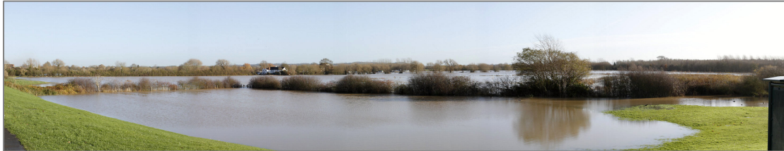
Fig. 1 Floods have been the story of this autumn and winter so far. This photograph was taken looking NE on 23 Nov 2012 when the water level was 16.82m aod.