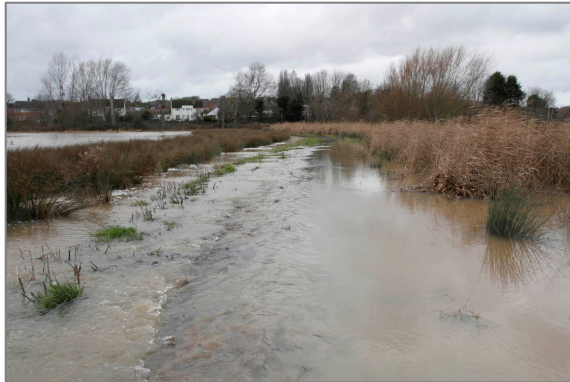
Fig. 4 Water rushing from the main pool over the south bund on 23 Dec 2012. (R D E Stott)

occurred on 26 November when 17.24m aod was recorded (derived from the Environment Agency's data on its website). One of the foot bridges near the northeastern boundary of the Wetland has floated away from its correct position and should not be used until we have had time to reposition it.