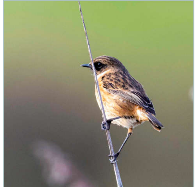
A nice female Stonechat, a familiar sight in the South Meadow this winter.