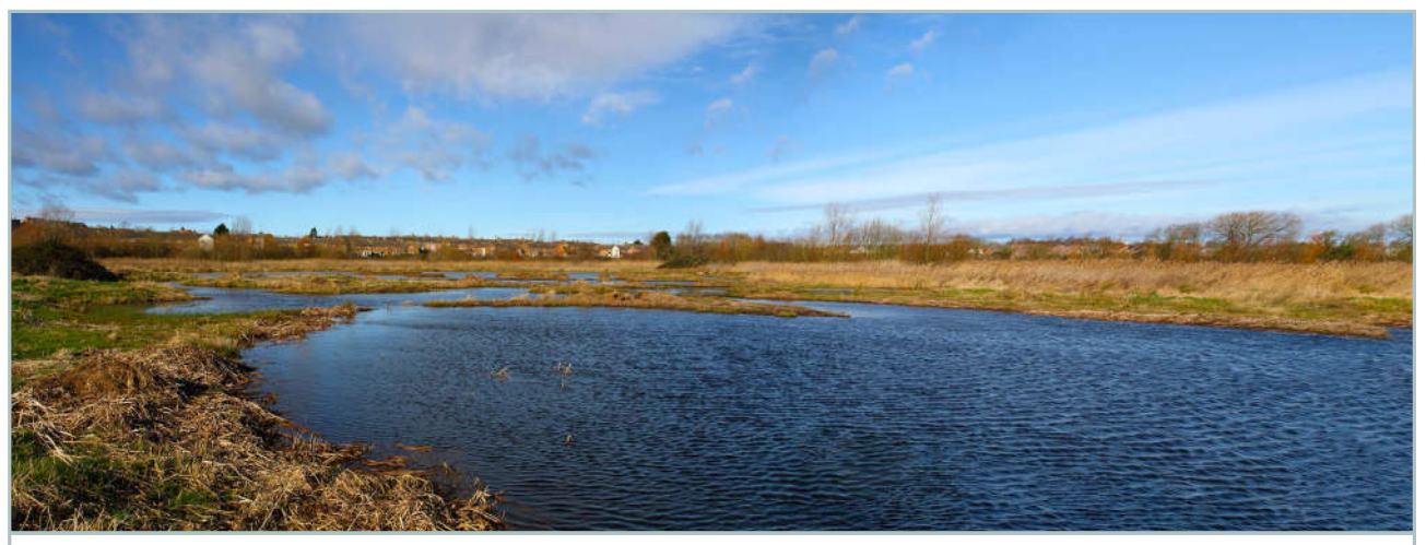
The scrape cleared by volunteers and now nicely filled with water.